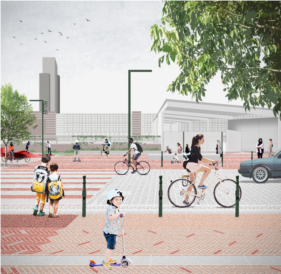
Vision for the Klavertje Vier primary school forecourt.

Complex emergencies such as the pandemic, as well as those related to climate change, present the greatest opportunities and threats to local and regional governments. This new understanding of public space that is here to stay. This is a space for play, exercise and carry out