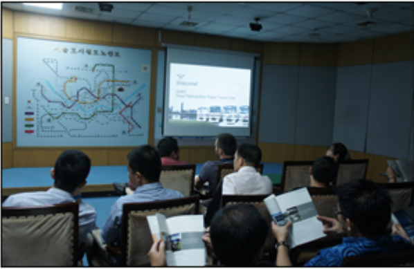
Seoul Metropolitan Rapid Transit Corporation