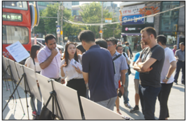
Public Transport-Only Zone