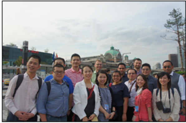
Seoul Station Bus Transfer Center