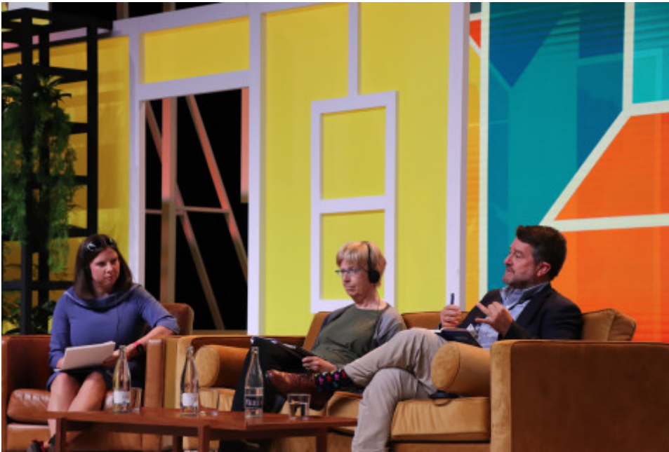
Claudio Orrego during a plenary session of Smart City Expo 2022