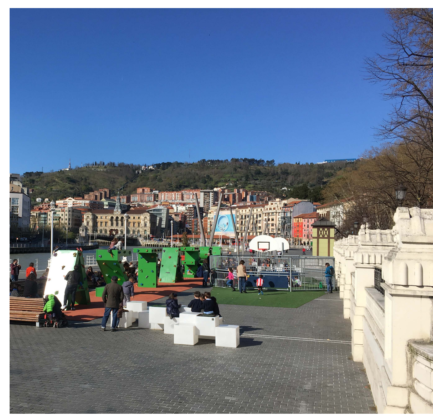
Functional Metropolitan Area of Bilbao, Spain. 2016.

formal arrangements should also seek ways to include civil society representatives in their governing bodies. On their part, metropolitan and regional institutions' technical teams must design and implement participatory methodologies that guarantee social inclusion during project implementation, services provision, and formulation of plans and other instruments.