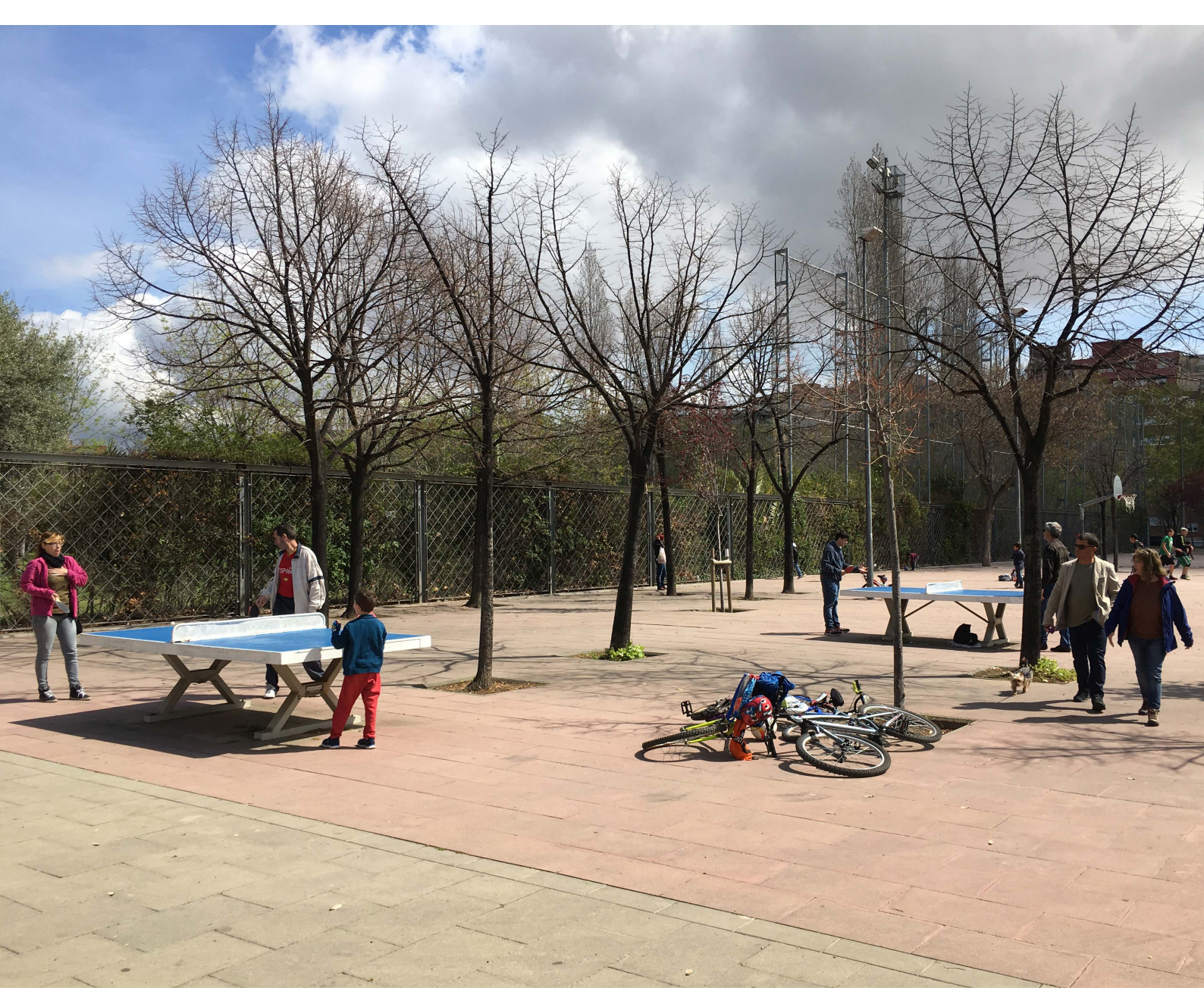
Metropolitan Area of Barcelona, Spain. 2016.

instruments, especially in those with medium- and long-term time horizons. Finally, to the extent possible and as appropriate, development visions should be inspired by global agendas and should link land-use and territorial planning with socioeconomic development.