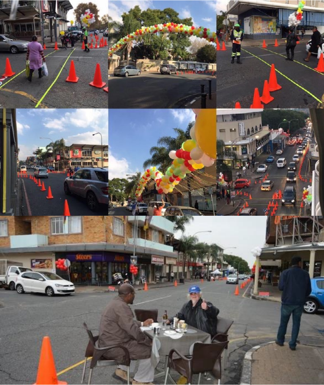
Figure 5: Objects and materials used to test planning and design concepts in Norwood.