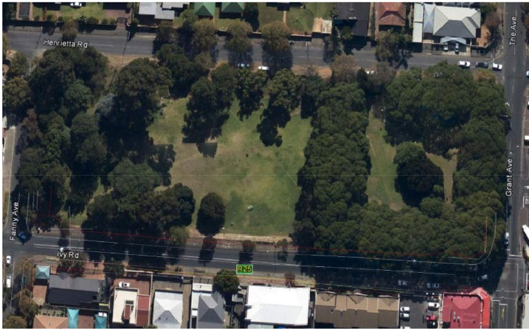
Figure 7: The current state of Norwood Park (aerial view). Norwood Park is currently an uninviting, closed-off space. The trees block sight-lines and make residents wary of walking through the park at night. During consultation processes, it was agreed that several trees would be removed and branches of others would be cut back to introduce more light and improve visibility in the park. However, the trees also provide a resource for homeless people who hide their belongings in the branches during the day. Cutting back the trees will therefore have negative consequences for these vulnerable people. These contrasting objectives exemplify the struggles and competing interests at the heart of the neighbourhood and its upgrading process.