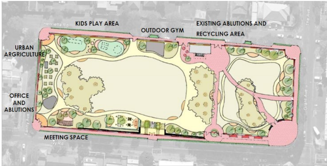
Figure 8: Initial design for upgraded Norwood Park. An architect’s rendering of the initial design for upgrading Norwood Park, including a play area, spaces for urban agriculture and ablution facilities.