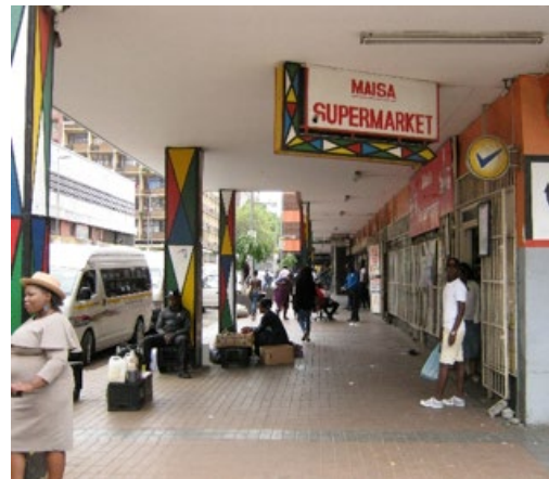
Figure 10: Informal traders in the Ekhaya RCID. Informal, unlicensed pavement trading contravenes City by-laws and is not tolerated by the JMPD. It is, nevertheless, very much present in the immediate environs of Ekhaya member buildings, suggesting that a mutually beneficial relationship exists between traders and some building managers within the Ekhaya precinct. The top two photographs show the same entrance to an Ekhaya member building: the top left photograph shows the entrance during the day, the top right photograph, at night.