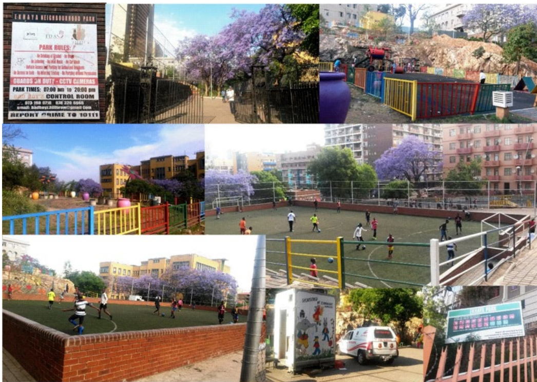
Figure 6: The amenities, recreation activities and management partnerships of Ekhaya Park.