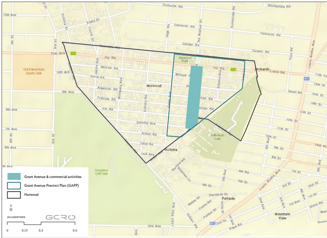
Figure 3: Location of the Grant Avenue Precinct. Map drawn by Samy Katumba