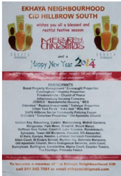
Figure 9: Safe New Year's Eve campaign poster displayed inside a residential building in the Ekhaya RCID.

The role building managers play in disseminating norms throughout the neighbourhood and institutionalising visions and practices is evident in the preparation and planning of social events for the neighbourhood's children – Ekhaya Kidz' Day and the Ekhaya Street Soccer tournaments. These events are organised by the Ekhaya coordinator, but because the housing managers live in the buildings they govern and are familiar with their tenants, they organise the participants from each building and are entrusted with the children's safety. These activities help to realise the vision of Hillbrow as a safe, stable, family-friendly neighbourhood.