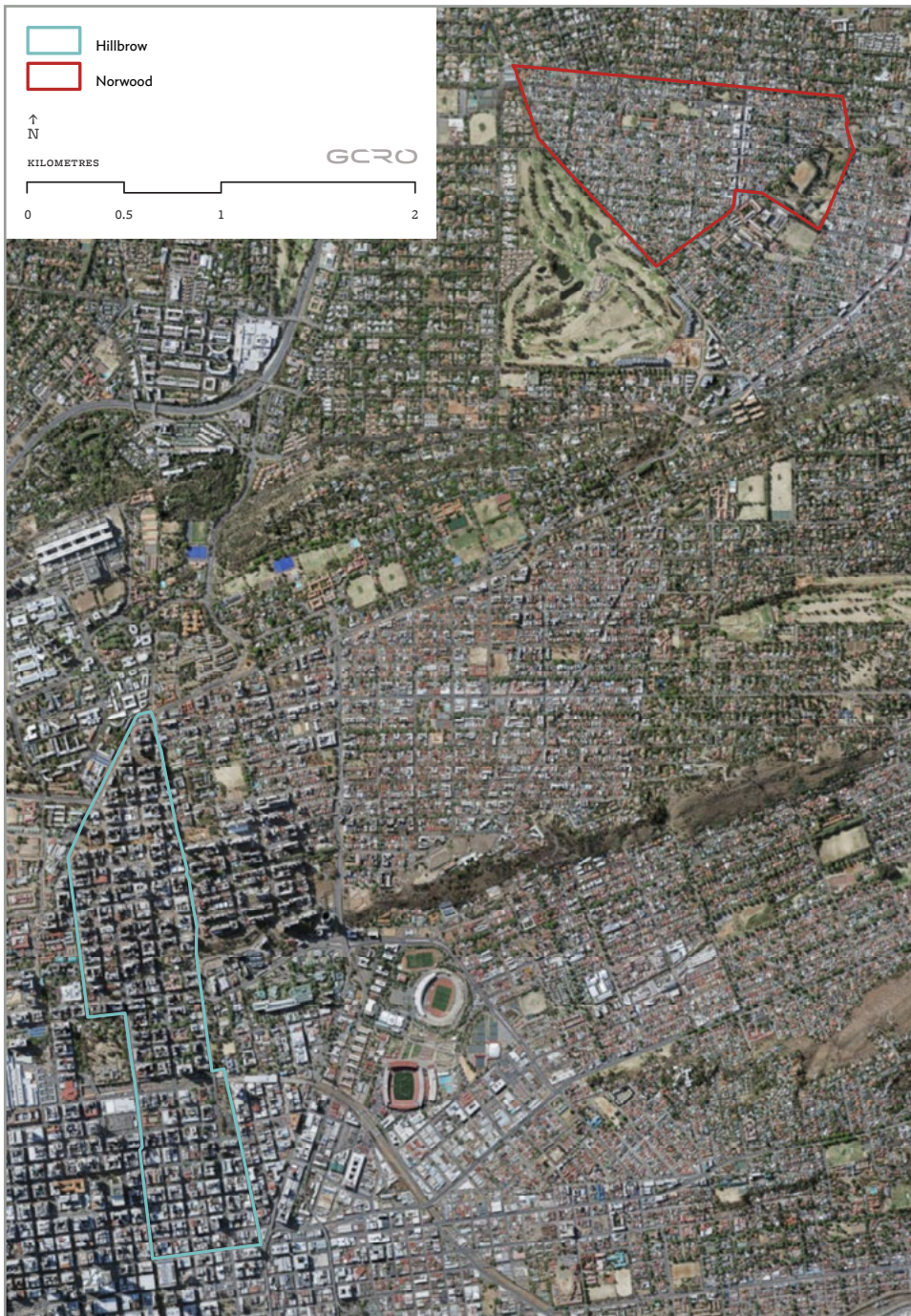
Figure 1: Location of Hillbrow and Norwood.